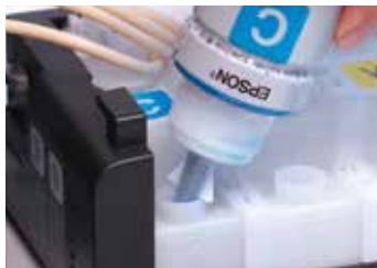
Smart tip design for easy, mess-free refills