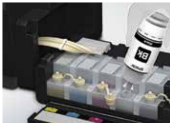
Specially fitted tubes ensure reliable ink flow without leakage

Epson's original ink tank system is designed for smooth, no-mess operation in corporate and SOHO environments.