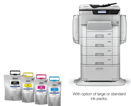
With option of large or standard ink packs.