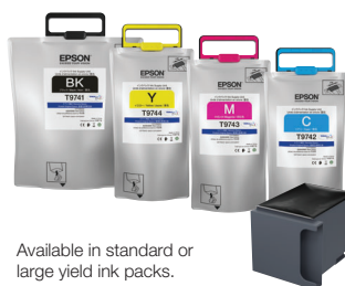
Available in standard or large yield ink packs.

With Epson's Replaceable Ink Pack System (RIPS), exorbitant printing costs are a thing of the past. The revolutionary RIPS features four ink supply units and a waste ink box, giving you uninterrupted printing of up to 86,000 pages in black or up to 84,000 pages in colour. With such page yields, you enjoy maximum cost savings and minimum running costs.