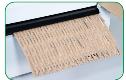
Produces flexible perforated cardboard netting, at speeds of up to 34 fpm