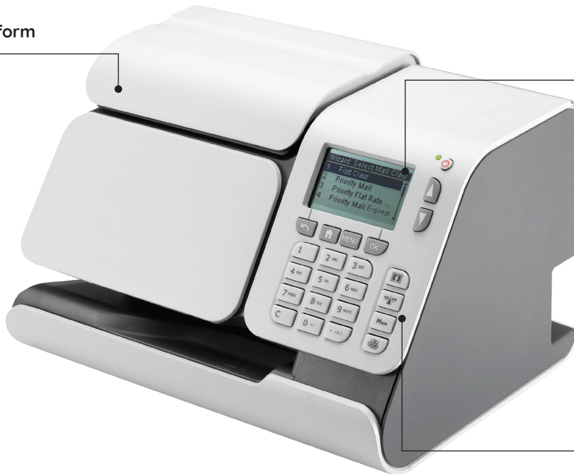
3. Shortcut Keys